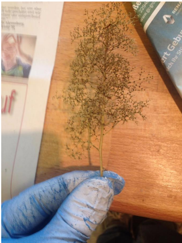
Super trees have very skinny trunks