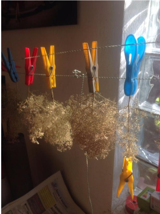
Hang to dry